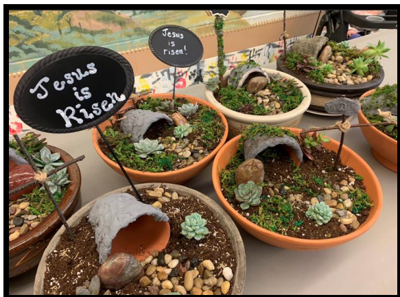
April 10, 2019